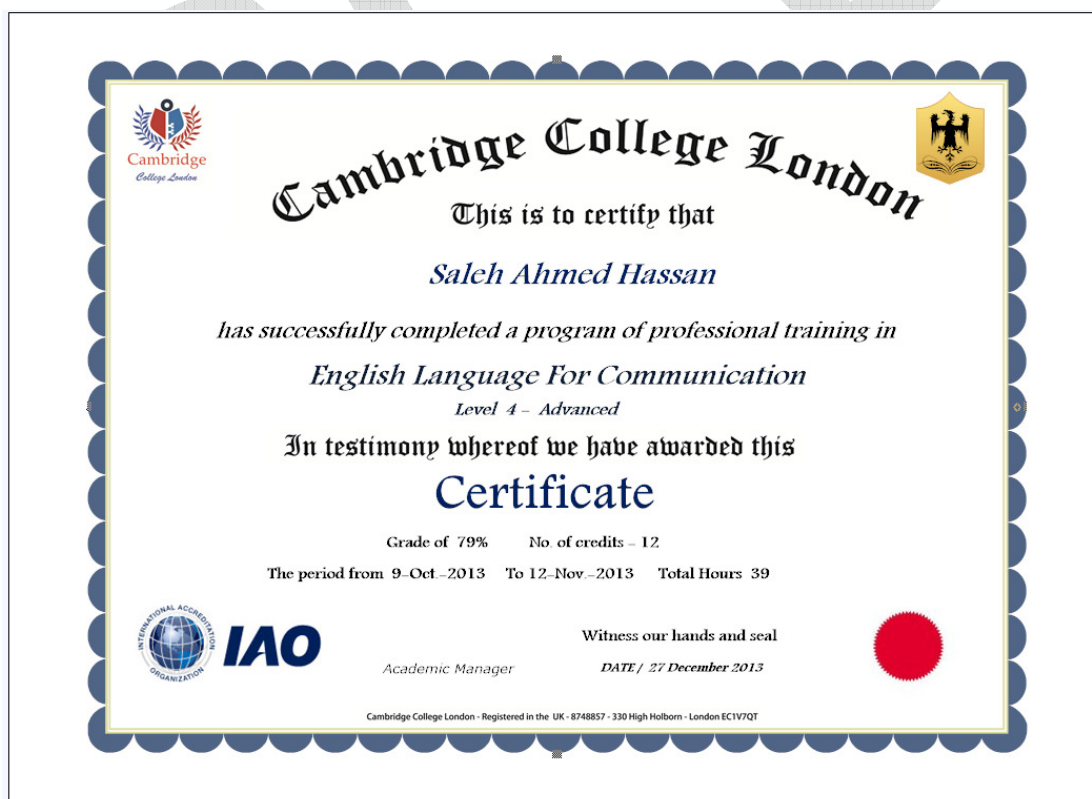
Sample Students Certificate

You will be provided with this series of books and their teaching materials to run your own classes ( Instructor Lead Training [ILT] ) and your students will receive their certificates from Cambridge College London.